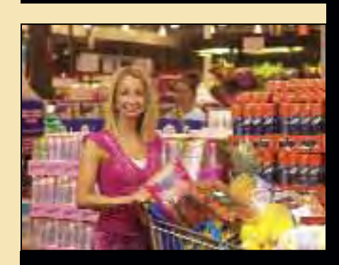
HEALTH & BEAUTY