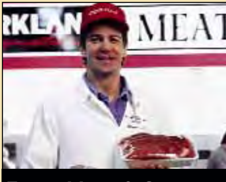
FRESH MEAT & SEAFOOD