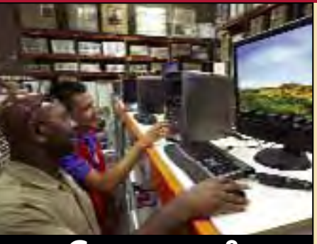
COMPUTERS & ELECTRONICS