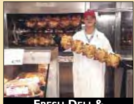
Fresh Deli & Rotisserie Chicken